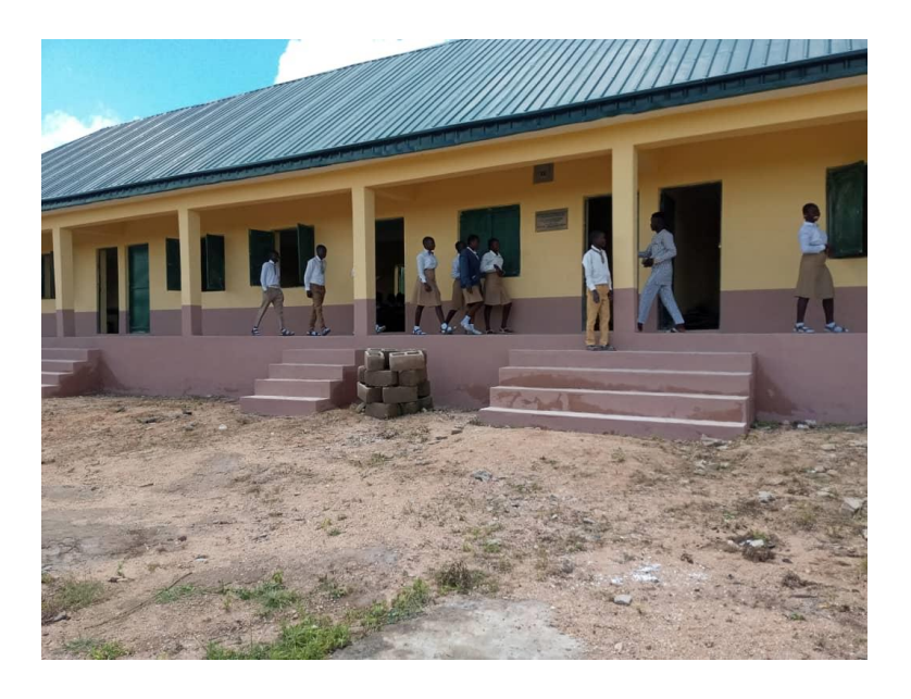
Some of the 200+ students making their way to their classrooms.