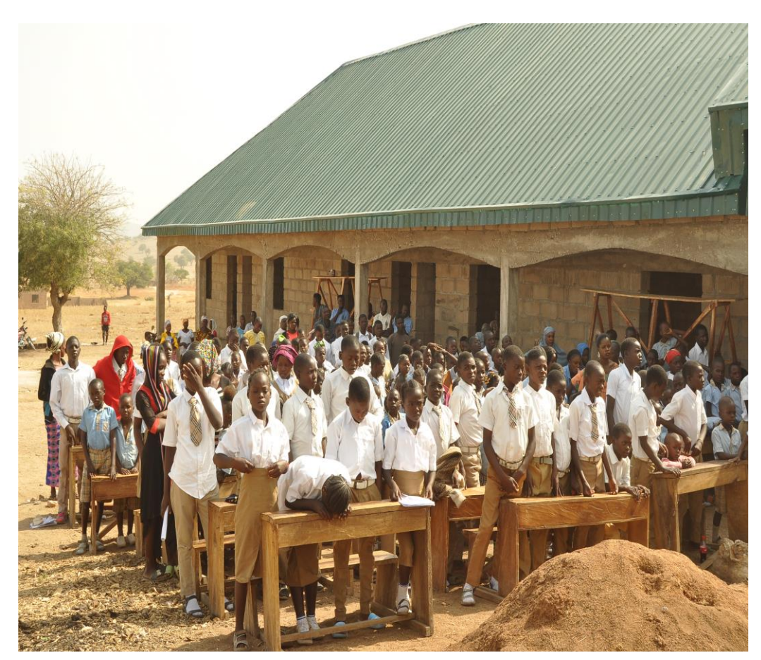
A section of the students during St. John Bosco Academy's End-of- Year Mass celebration December, the 18^{\rm th} 2020.